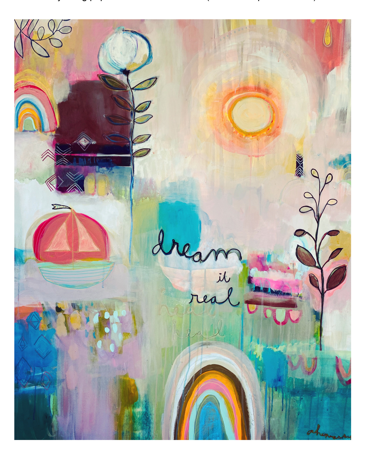
And so much more! What else can you come up with?

Layered Wabi Sabi Painting . Create a painting now that is simply about the Wabi Sabi principles and layers. This can look so many ways! Review the videos I have posted to gain understanding of this. Mostly importantly, paint and fall in love with your process to come up with your own steps. You can also do a collage for any of these by using paper as an added material (see warm up or Week 11).